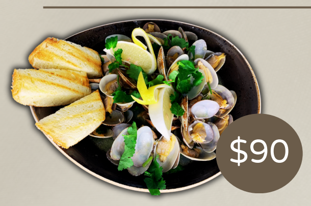
Amêijoas a bulhão pato Clams in white wine, lemon and ginger sauce 白酒香檸芫茜汁煮蜆 Suggested pairing: white wine