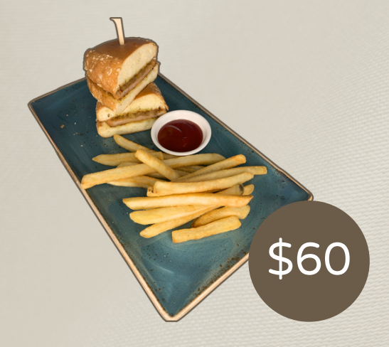
Bifana Pork sandwich w/ caramelised onion & garlic purée 猪肉三文治配焦糖洋葱及蒜 Suggested pairing: beer or white wine