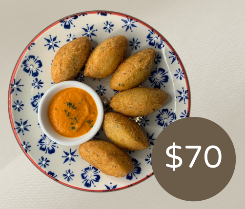
Pastéis de bacalhau - 6 pcs Codfish cakes with bell pepper dip sauce - 6 pcs 馬介休球配波椒醤 - 6 pcs Suggested pairing with white or sparkling wines