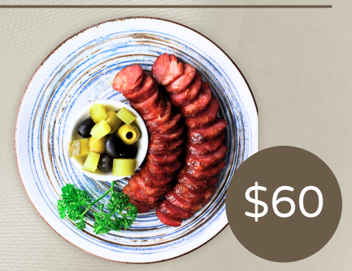
Chouriço assado Braised chorizo in brandy 百蘭地炆香腸 Suggested pairing: red wine