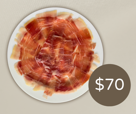
Pata negra 24 months - 50 gramas Ham 24 months - 50 grams 24个月火腿 - 50 grams Suggested pairing with red white or sparkling wines