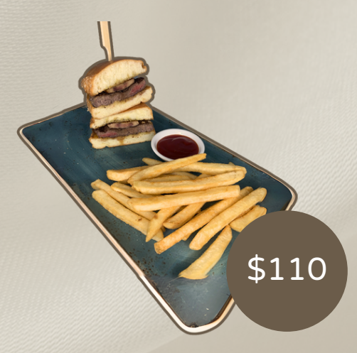
Pregos com foie gras Steak sandwich with foie gras 迷你鵝肝牛扒包 Suggested pairing with beer or red wine